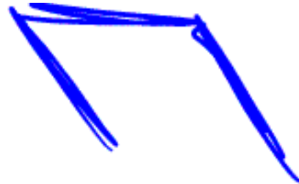
Figure 1: Example of an overtraced stroke.

Copyright © 2004, American Association for Artificial Intelligence (www.aaai.org). All rights reserved.