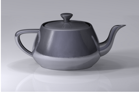
Figure 2: This is an example of a single-column figure.

If you need a number in an equation, you can do that as follows: