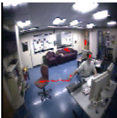
Figure 2: The last frame of a 30 frame sequence with five trajectories identified. Four nearly stationary trajectories were found (one on the person’s head, one on the person’s hand, one on the couch in the background, and one on the door in the background). The final trajectory resulted from the chair being pushed across the floor.

to prior trajectories are generated. These hypotheses include representations for false alarms, non-detection events, extensions of prior trajectories, and beginnings of new trajectories. The set of all hypotheses is pruned at each time step based on statistical models of the system noise levels and based on the similarity between detected targets. This similarity measurement is based on similarities of object features such as color content, size, and visual moments. At any point, the system maintains a small set of overlapping hypotheses so that future data may be used to disambiguate the scene. Of course, at any time step, the system can also produce the set of non-overlapping hypotheses that are statistically most likely. Figure 2 shows the last frame of a 30 frame sequence in which a chair was pushed across the floor and the five trajectories that were located.