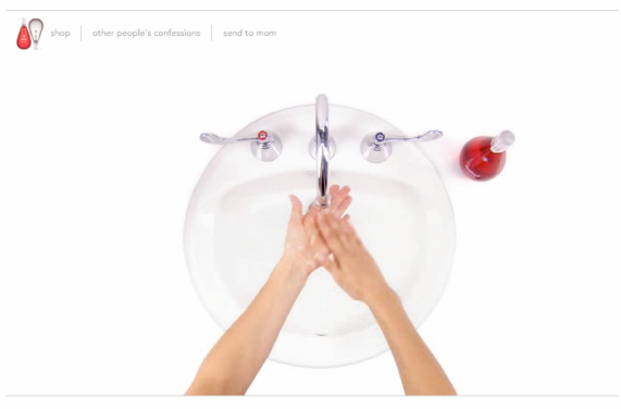
Figure 5. Screenshots of comeclean.com where confessed messages input by users can be washed away.