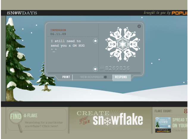
Figure 4. Cut-out snowflakes tailor-made by individual users carry their greeting messges evocative of personal memories.

In contrast, some websites absorb users and provoke imaginative stories not in a spatial environment but rather through a mini narrative. Comeclean.com invokes standard interface mechanisms such as data-entry and animated composite images to arrive at a metaphorical projection in which users can wash away sins. A user is first presented with a subjective view of looking down at a sink basin and is welcomed by a consoling voice speaking in English with a South Asian accent, prompting a confessed message. Once the user types in a message, the website shows that the message is handwritten on the photographic palm of a hand and then is washed away with a cleansing foam in a real-time composite moving image. The site, in fact, is an advertisement for cleaning supplies, yet the blend of the micronarrative of washing one's hands using particular cleaning supplies and the user's wish image of becoming spiritually clean after confessions of sin comes up with an imaginative image of the supplies cleansing both the body and the soul. Of course, the user is required to also blend her or his own hands with those depicted in the image regardless of their similarity.