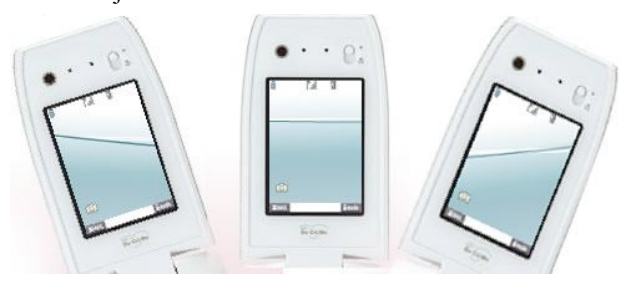
Figure 3. A mobile phone interface where battery level is indicated via the illusion of a water-filled container.

On the Japanese mobile phone N702iS, a proprietary interface displays computer-generated imagery of water that looks as if "contained" inside the phone's screen. When the user tilts the phone, the rendered water surface moves in response to the action. The simulated reaction to motor action constitutes a blend of the user's current situation of holding a mobile phone and her or his mental image of holding a water container, creating the illusion of a water-filled mobile phone. What makes the artifact even more intriguing is that the rendered water level represents the battery level. This articulation further incites the user to project a mapping from checking power consumption perhaps to an imaginative narrative about someone in some harsh environment checking how much water is left or a similar tale of water-conservation. The elaboration of such blend leaves the user a strong and provocative message: "save the juice!"