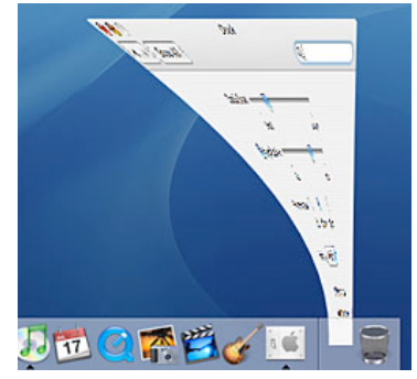
Figure 1. The "genie" effect in Macintosh OS where windows dynamically stretch and shrink.

The first animation-driven imagination phenomenon we analyze here is prevalent in GUI features. For instance, in the Macintosh OS X environment, when a user clicks on an icon in the dock (alias icons grouped at the periphery of the screen), it responds with bouncing up and down. The user understands that the application is beginning the process of opening. Following Fauconnier's perspective on immediate blending, the user effortlessly blends the clicking action and bouncing feedback with socially recognized forms of body language for anticipation – restless shifting or bouncing as experienced in one's everyday life. The outcome is a new concept of calling a responsive and attentive application in. Meanwhile, if the user clicks on an icon of a minimized window, the window stretches and twists into place like a playful genie coming up from its lamp. The user knows the connotative meaning when blending the perceived twisting with the genie from film or television. This imaginative concept is a "powerful" genie application serving at your wish in a multitasking environment at the same time as suggested spectacular, magical function (in potential reading of the effect as spectacle or gimmick).