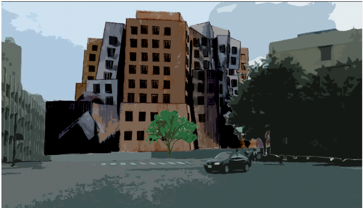
Enlarged view of Figure 27. This scene depicts a proposed building within its real context. In addition to the panorama of the site, the scene contains three perspective rectangles with projective textures and transparency channels.