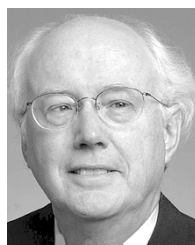
David D. Clark (F'98) received the Ph.D. degree from the Massachusetts Institute of Technology (MIT), Cambridge, in 1973.

He is a Senior Research Scientist at the MIT Computer Science and Artificial Intelligence Laboratory, where his work on the Internet started in 1975. Recent activities include extensions to the Internet to support real-time traffic, pricing and related economic issues, and policy issues surrounding the Internet, such as broadband local loop deployment. His current research looks at re-definition of the architectural underpinnings of the Internet, and the relation of technology and architecture to economic, societal and policy considerations.