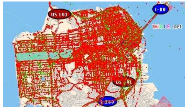
Figure 1: A map of San Francisco. Each red point represents one Wi-Fi AP (from WiGLE.net, accessed on Jul 26, 2007).

the network infrastructure is already in place: A majority of city dwellers have a broadband connection and a personal Wi-Fi AP at home. As Fig. 1 suggests, in dense metropolitan areas such as San Francisco, there is sufficient density of APs to achieve near-ubiquitous Wi-Fi by sharing access to APs amongst residents.